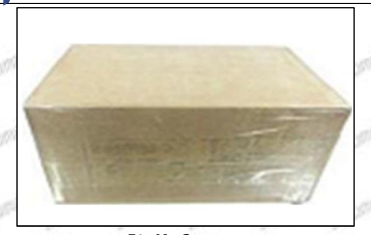
Pic No.2 Domestic express packaging: Wrapped by Transparent tape